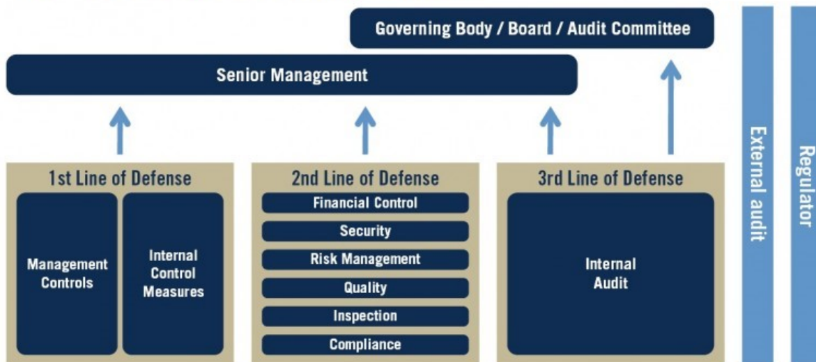
The Three Lines of Defense Model