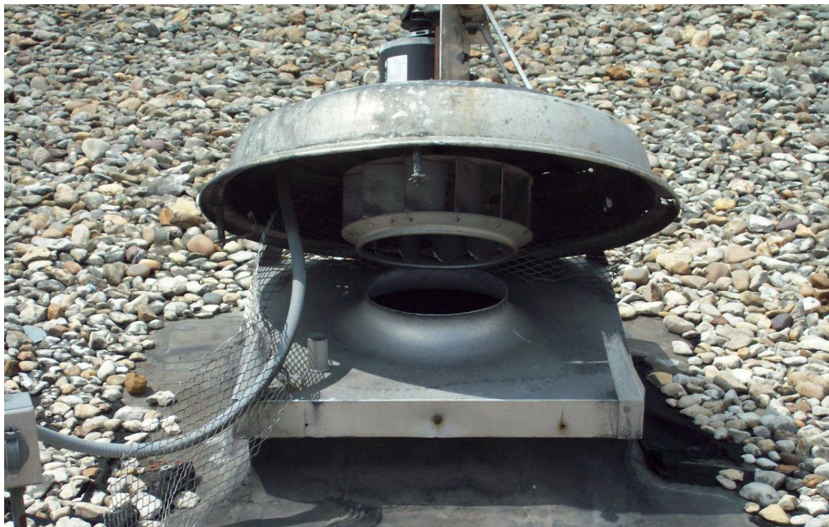
Damaged roof top equipment

Yellow areas indicate moisture in the roof system.