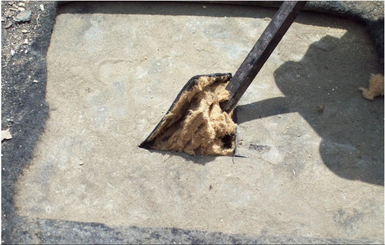
Core cut indicated wet below the first roof.